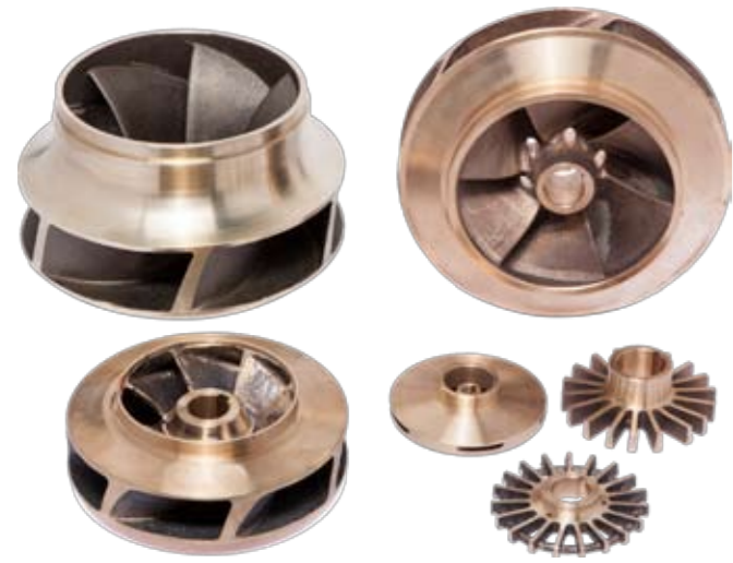
Impellers: Marine bronze, AISI316