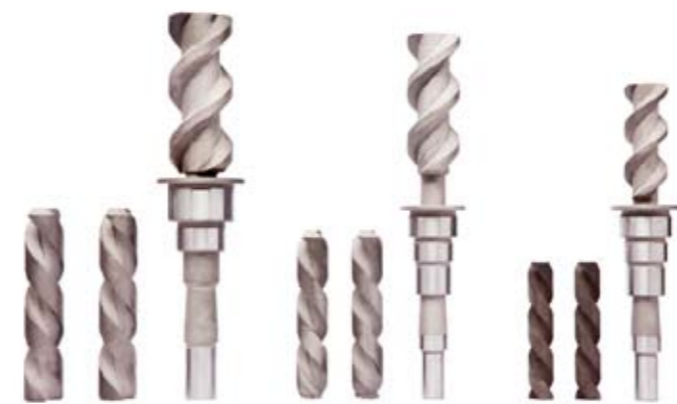
Rotor Set for three screw and gear pumps