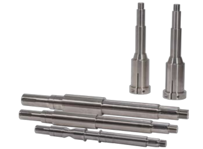
Pump shafts: AISI316, AISI420, Duplex