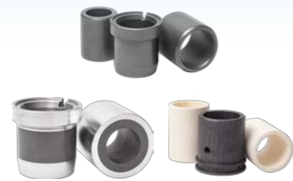
Bushes and sleeves:

AISI316, bronze, aluminium, syntherized, thordon