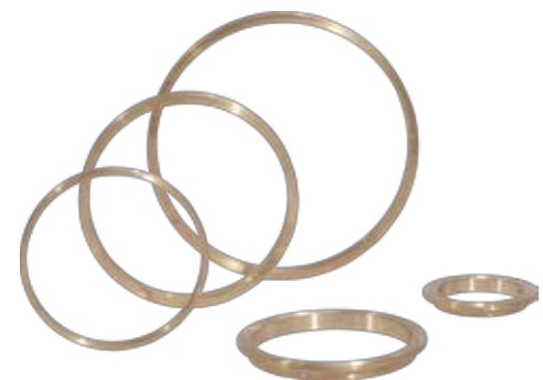
Wear rings: Marine bronze, AISI316