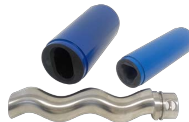
Spare parts for monoscrew pumps