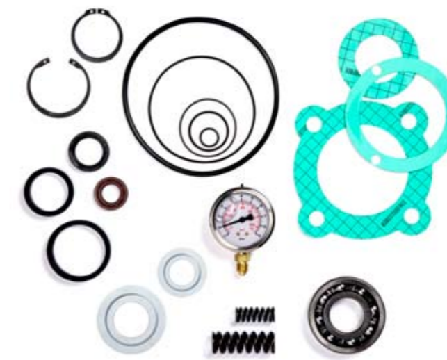
Gaskets and O-rings - Electric motors