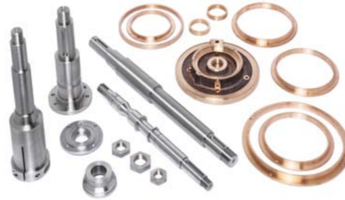
Spare parts for hollow disc pumps