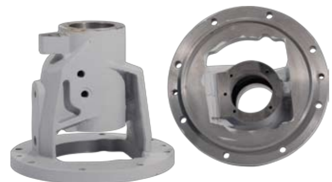
Bearing brackets and support for pumps